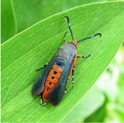
Squash Vine Borer Moth