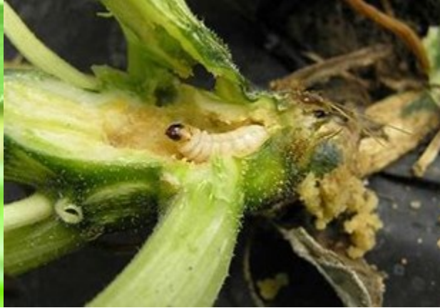
Squash Vine Borer Grub. Grubs cause significant damage to squash plants.