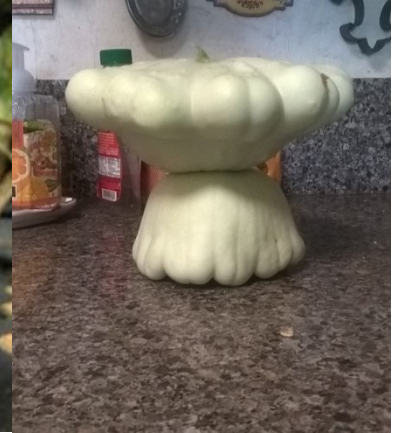
Patty Pan Squash

Squash is growing in Broadmoor this season. Six different kinds in fact. Neighbors are having success with zucchini, yellow zucchini, yellow crooked neck, acorn, spaghetti and even patty pan. However, one nuisance has reared its ugly moth head—the evil squash vine borer. The moth lays eggs at the base of the leaves and vines of the plant. Later, the grub eats through, killing the plant. For those who are not familiar, it is a nasty moth that lays eggs at the base of leaves and vines of the plant. The best way to eradicate the squash vine borer is to kill the moth the organic way. Sevin Dust at the base of the plant works when the plant starts to make fruit, but read labels for guidelines on consumption.